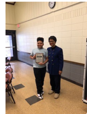
Entrepreneur of North Minneapolis