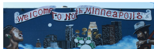
Community & Communications

We now have an electronic monthly newsletter. Look for it via email, website, FaceBook or Nextdoor Hawthorne.