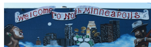
Community & Communications