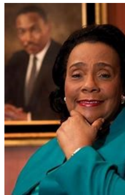
Coretta Scott King