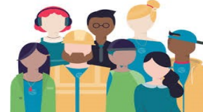
Crime Prevention & Family Safety